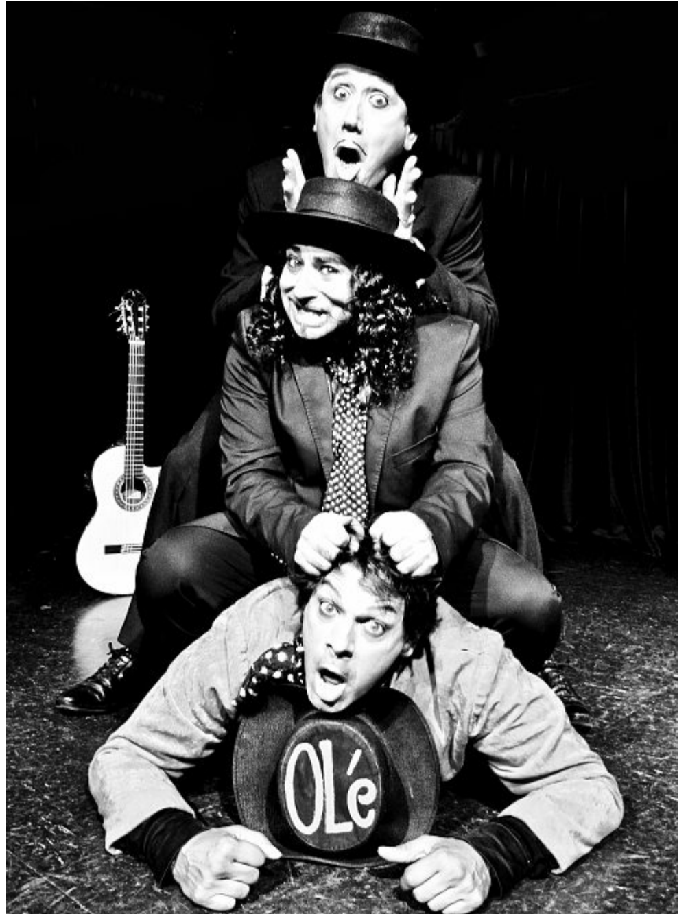
OLE will perform at Noosa Alive 2018.

In the words of DAR himself: "Bring it on folks!"